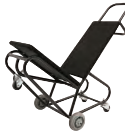
Comfort Seating RS Cart