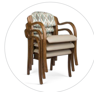
England chairs are stackable

Due to the sewing and style of the chair, upholstery options are restricted to solids and non-matched patterns. Striped fabrics and fabrics that need specific alignment are not recommended. See holsag.com/fabrics for selections.