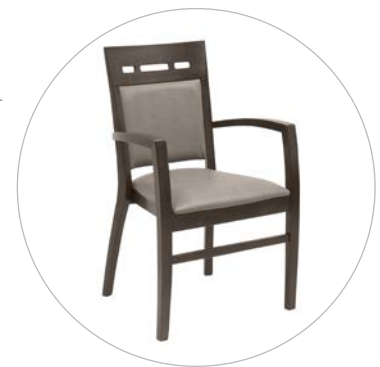
Sussex arm chair also available