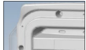
Innovative Flex-Fit™ Seat